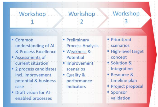
Figure 1: Processes & AI Fast Start Method